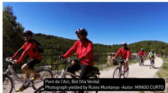
Pont de l'Arc, Bot (Via Verda)

the towns of Arnes, Horta de Sant Joan, Bot, Prat de Comte, Pinell de Brai, Benifallet, Xerta, Aldover, EMD Jesús, and Roquetes and is 100kms in total. The very slight climbs on the route which only varies by 400 metres accumulated, make it easy and suitable for those on foot and on horseback too. It includes a section for the disabled.