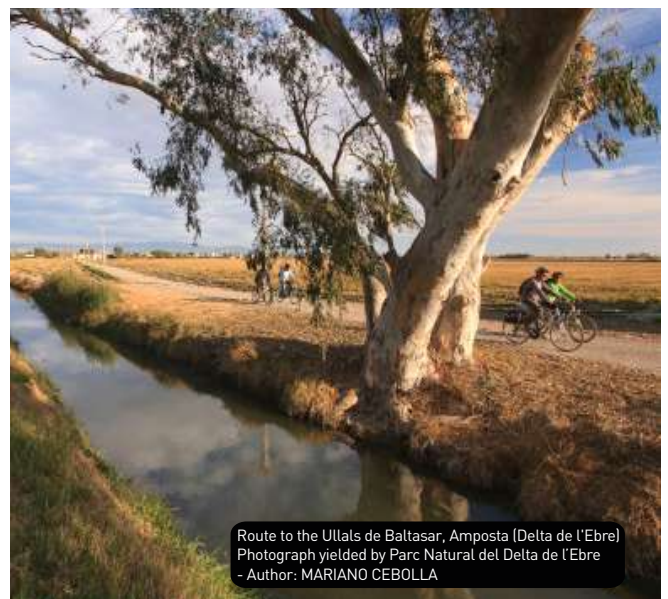
Route to the Ullals de Baltasar, Amposta (Delta de l'Ebre)

Visitors are well served by tourist information points and offices, including in both Protected Areas (Els Ports and the Ebro Delta), where they can find details on everything to do with the cycleways and related services.